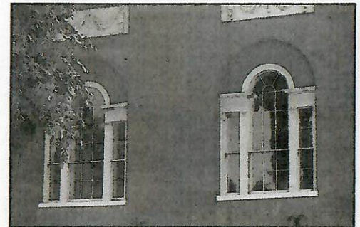
Palladian windows in Samuel McIntire's Hamilton Hall add to the architectural richness of Chestnut Street.