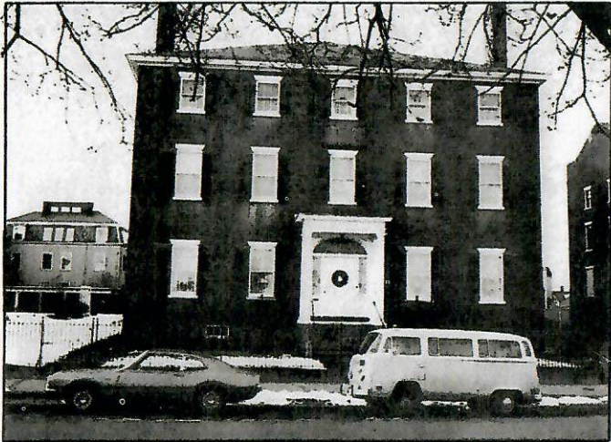
An imposing Federal brick residence, the Home for Aged Women, 180 Derby Street, commands a fine view of Salem Harbor.