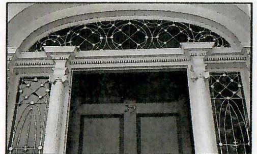
This Federal doorway was altered at the turn of this century to reflect the changing architectural styles.